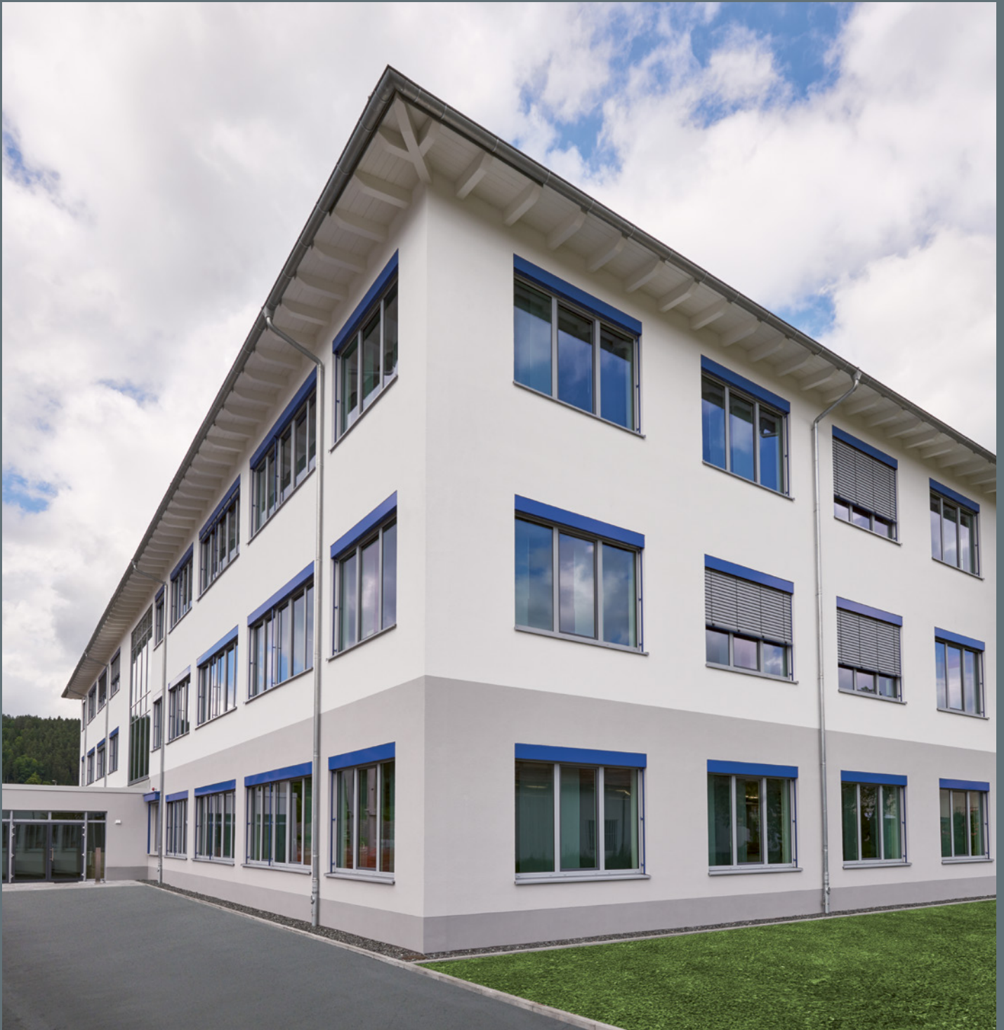
DR. SCHNEIDER R&D CENTER, KRONACH