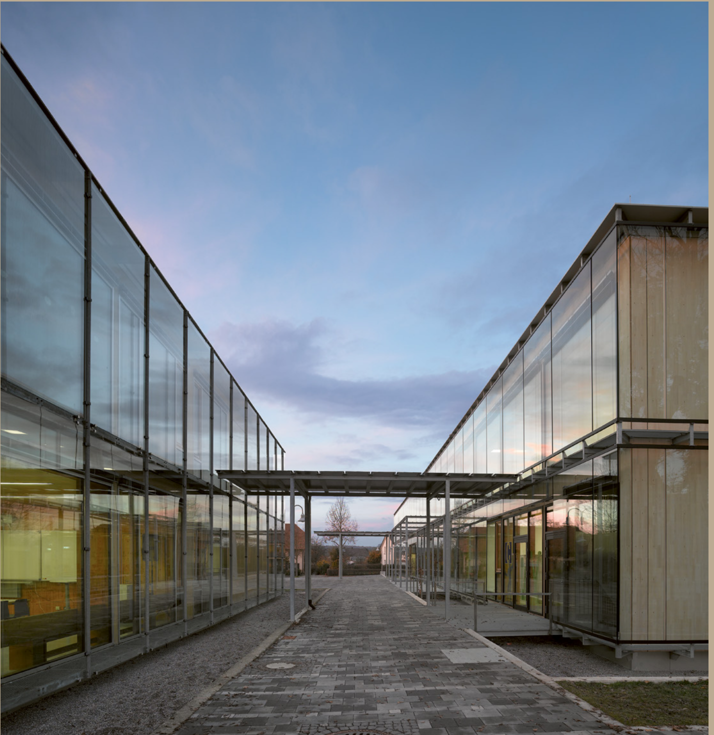
STEISSLINGEN COMMUNITY SCHOOL