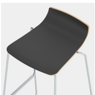
Invisible fastening of the seat shell