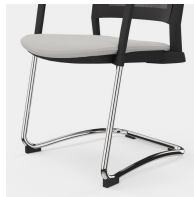
Robust cantilever frame